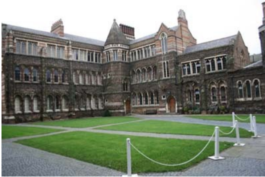
and the Headmaster

A tour of the school followed the meeting and we saw where Rugby football was first played and saw some of the places that formed the backdrop to the famous novel "Tom Brown's Schooldays".